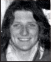
Bobby Sands 5th MAY 1981

39 years ago, Óglach Bobby Sands died in the H Blocks of Long Kesh after 66 days on Hunger Strike. He was 27 years old. He had spent one third of his 27 years in prisons. He was never interviewed on television or radio and we only have a few photographs of him. The image of him which is known around the world was taken in Long Kesh on a smuggled camera when he was nineteen. There he is, long hair, open-neck shirt, red V-neck jumper, a big warm smile on his handsome face, never realising that in a few years' time he and his comrades would be plunged into a Thatcher-made hell. The intent of Thatcher and her Government in removing Special Category Status from the republican prisoners was to try to portray them and the cause they fought for as criminal. Bobby, a Belfast man, died on May 5th.