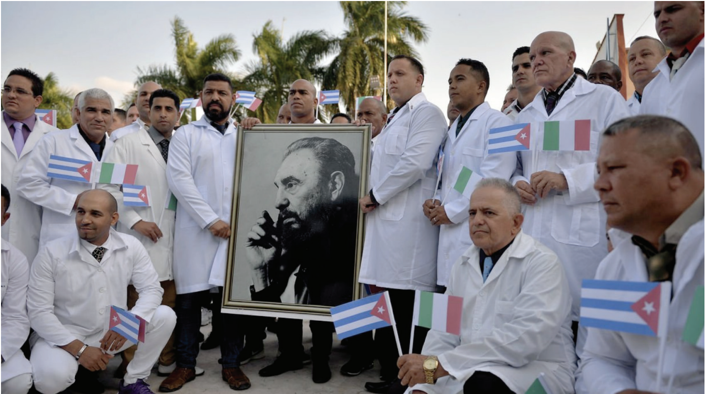
One of numerous medical brigades sent by Cuba to Italy to assist in battle against Covid-19