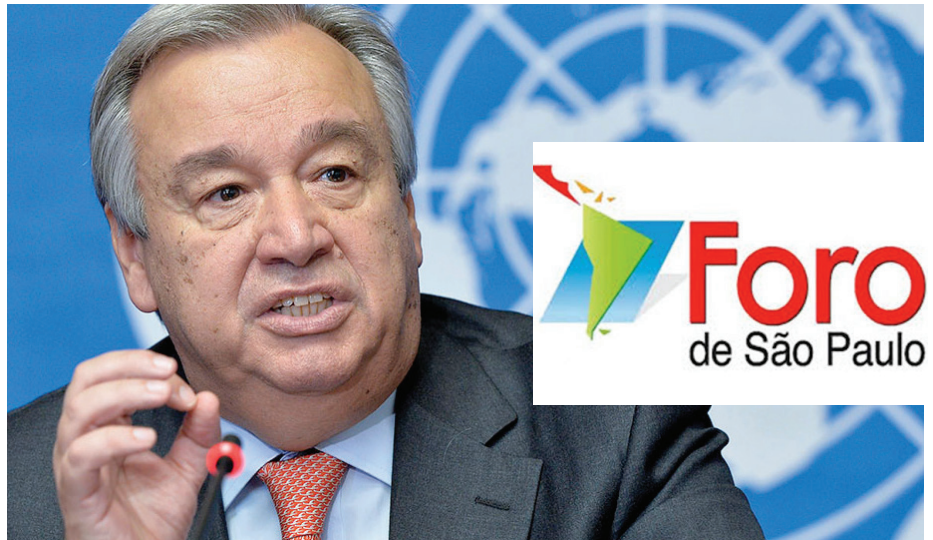
António de Oliveira Guterres, Secretary General of the United Nations

have unsuccessfully requested the lifting of sanctions in order to purchase supplies, medical equipment and medicines for their health system.