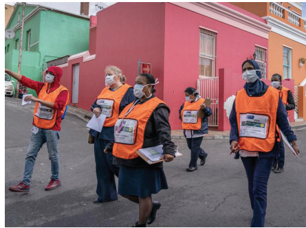
South African health workers conduct door to door community screening for Covid-19 in the Bo-Kaap district of Cape Town

As government, together with our many partners, we have used this lockdown period to both refine and intensify our public health strategy to manage the coronavirus.