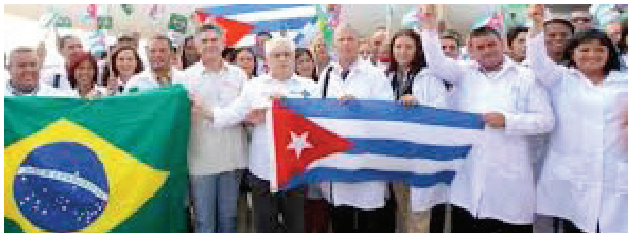
Cuban doctors arriving in Brazil

None of our people should become collateral damage as a result of our regional approach being fettered by a flawed British government policy, overseen by Tory ideologues. They will have to account at a later date for their inaction and slowness.