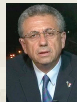
DR MUSTAFA BARGHOUTI PALESTINE NATIONAL INITIATIVE