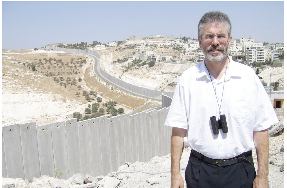
Gerry Adams has called on the Irish Government to oppose Israeli annexation of occupied territory in Gaza and the West Bank

At a time when Covid-19 is a major pandemic with unparalleled economic consequences for the world; when human rights abuses and the rights of citizens enshrined in UN charters are everywhere under attack; when