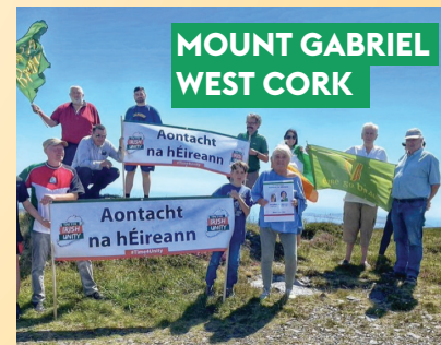
MOUNT GABRIEL WEST CORK