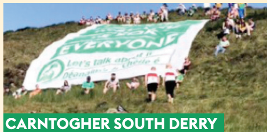
CARNTOGHER SOUTH DERRY