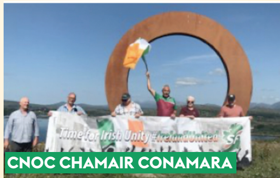
CNOC CHAMAIR CONAMARA