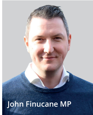
John Finucane MP

Responding to remarks by British Labour leader Keir Starmer during his visit to the North in early July North Belfast MP John Finucane said: "The future of our island and of how we as an island people share it together in peace, equality and inclusivity is our decision not Starmer's. That should also be the position of the British Labour Party." Starmer visited the North for two days and in the course of that visit he asserted his determination to stand "very much on the side of Unionists, arguing for Northern Ireland to remain in the UK". "I believe in the United Kingdom", he said. Starmer went on to claim that there is no prospect of a united Ireland in the foreseeable future. He said that such an eventuality is "not in sight".