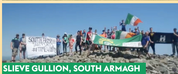
SLIEVE GULLION, SOUTH ARMAGH