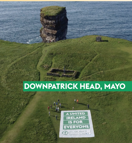
DOWNPATRICK HEAD, MAYO