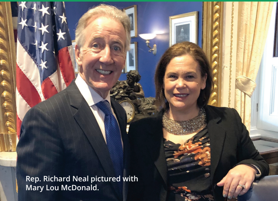
Rep. Richard Neal pictured with Mary Lou McDonald.