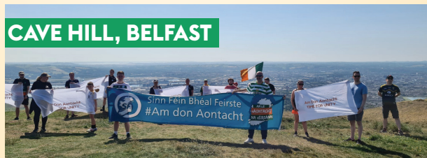
CAVE HILL, BELFAST