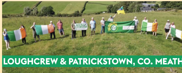
LOUGHCREW & PATRICKSTOWN, CO. MEATH