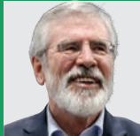
BY GERRY ADAMS

Apart from those years when I was imprisoned I have attended every Sinn Féin Ard Fheis since 1967. That is until this Ard Fheis. However through the marvels of modern technology I was only missing in body not in spirit. I watched the debates live online.