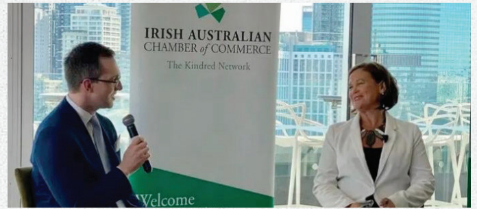
Mary Lou McDonald pictured at the with the Irish Australian Chamber of Commerce