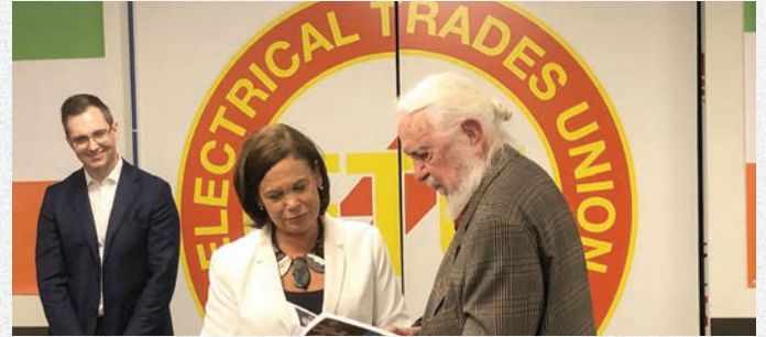
Mary Lou McDonald meeting the Electrical Trades Union