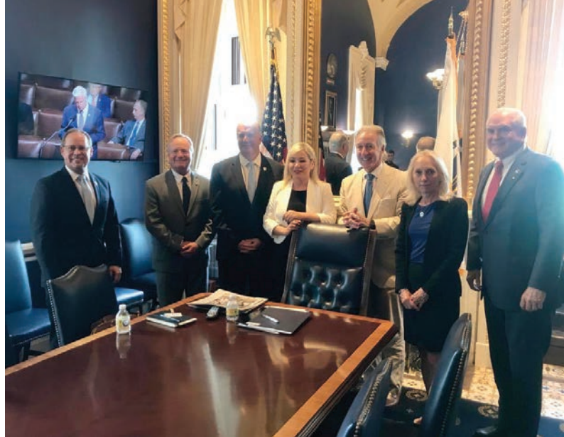
Friends of Ireland Group