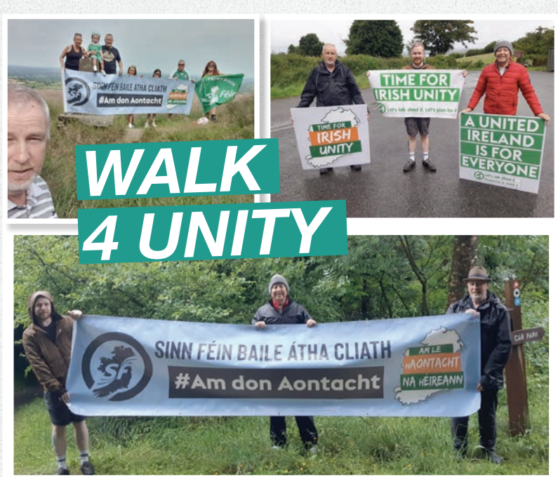
The Dublin Mid West Walking Crew are planning to take their United Ireland banner to all of the mountain tops on the island of Ireland. So far they have been to Kildare, Meath and West Meath and next week will be in Armagh.

The Sinn Féin National Party Chairperson added: "Brexit has changed everything across these islands. Just like the people of the North, Scotland overwhelmingly rejected Brexit and voted to remain with the EU. At the same time the momentum for constitutional change in Ireland has never been stronger. The Irish government should now also act positively, and immediately convene a national Citizens Assembly on the constitutional future of Ireland. This would represent an important landmark towards securing an Irish unity referendum."