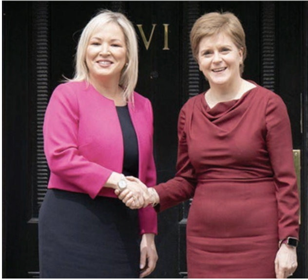
Michelle O'Neill with SNP leader Nicola Sturgeon, Edinburgh