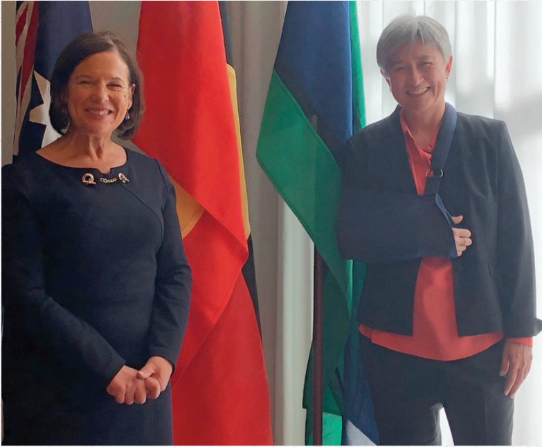
Mary Lou McDonald meeting Senator Wong, Australia's Foreign Minister

“It is very, very important that everybody, including unionism, understands they have a voice, stake and a say in the journey to a united Ireland and in shaping the final destination.”