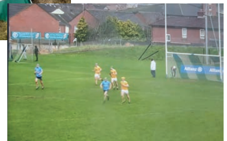
UI banners at the Antrim v Dublin hurling match at the weekend