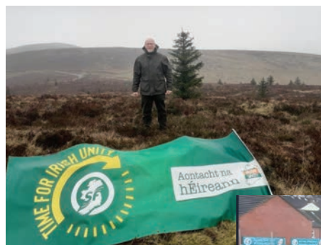
In the Cooley mountains...