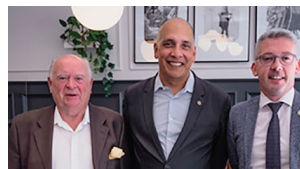
Sen. Niall Ó Donnghaile at Friends of Sinn Féin Canada public meeting in Calgary