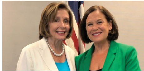
Mary Lou McDonald and Speaker Nancy Pelosi