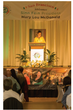
Mary Lou McDonald in San Francisco