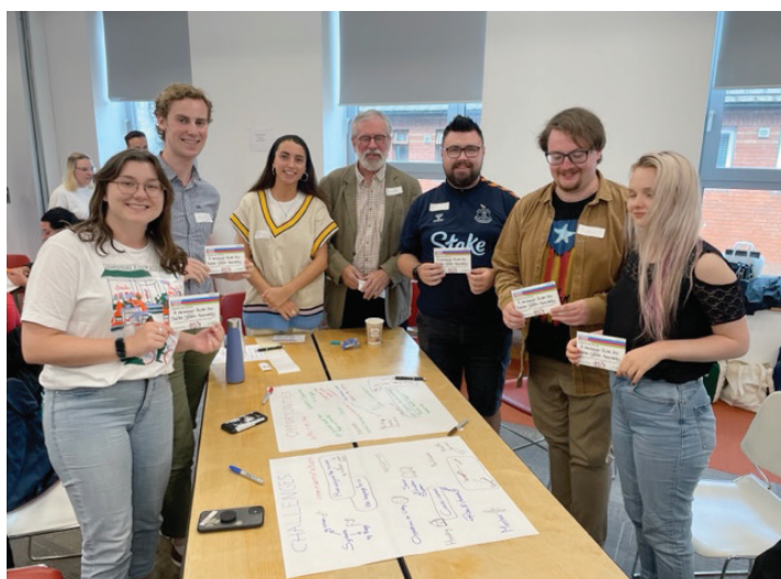
First words that come to mind when you hear 'Irish Unity'