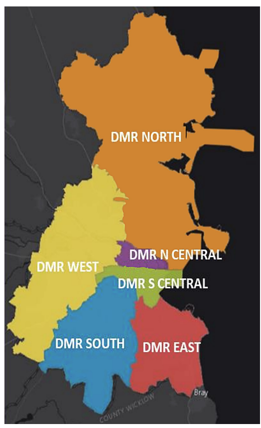
Figure 1 Dublin Metropolitan Region divisional boundaries (Policing Authority 2019)

This lack of new recruits are also cited as an area of concern by Gardaí in engagements with Sinn Féin.