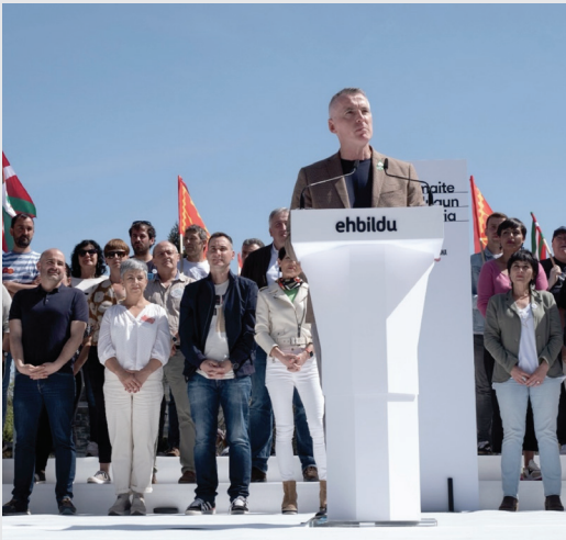
Declan Kearney MLA – Iruñea, Basque Country