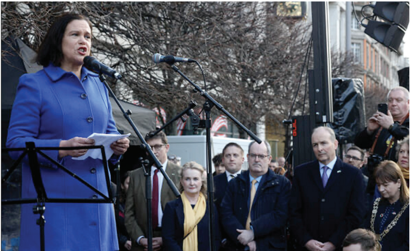
Sinn Féin President Mary Lou McDonald TD – GPO, Dublin

"This must be a lasting peace based on the values of democracy, integrity, and the rule of international law."