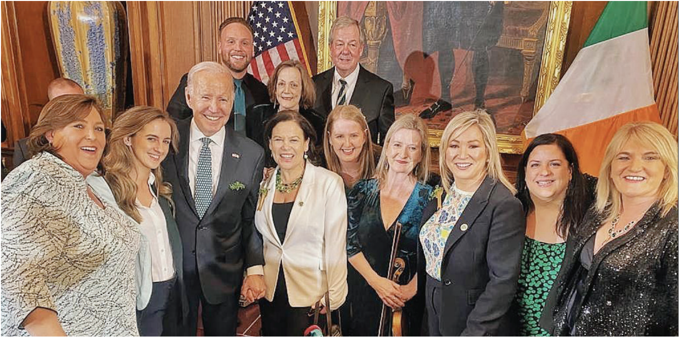
Sinn Féin leaders and US President Joe Biden – White House Guest Reception