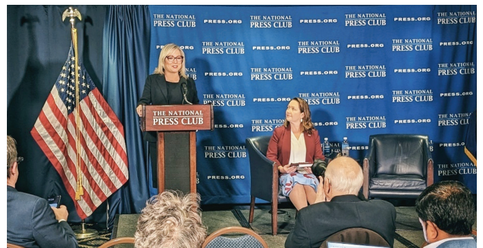
Michelle O'Neill MLA – The National Press Club, Georgetown University

During the visit, Michelle O'Neill addressed the National Press Club, hosted by Georgetown University, where she outlined her commitment to be a First Minister for All: