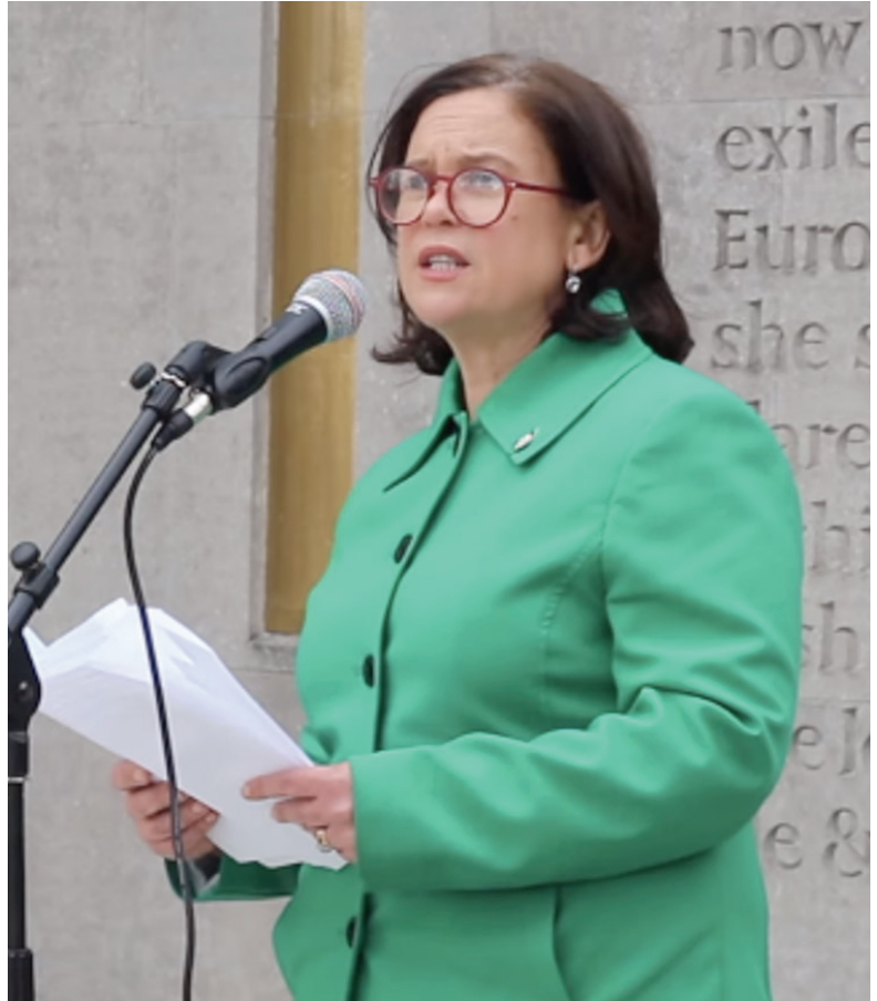
Mary Lou McDonald TD, Arbour Hill, Dublin

"Stay united and cohesive, be confident in your strategy."