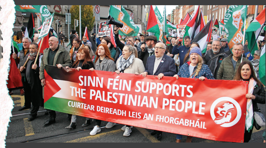
Palestine solidarity rally - Dublin, Ireland