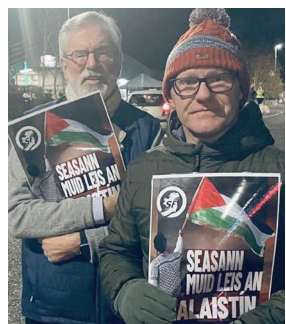
White Line Picket - West Belfast, Co. Antrim