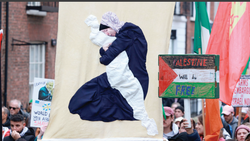
A poster illustrates a Palestinian mother holding her deceased child

Over 270 Palestinian citizens have been killed in the West Bank since 7 October.