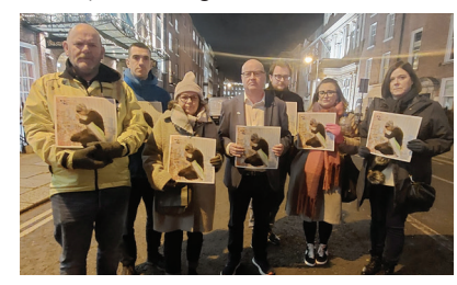
Candlelight Vigil, Dublin City Centre