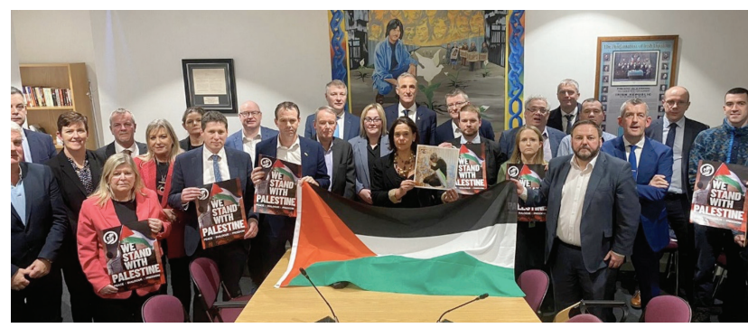
Sinn Féin TDs & Seanadóirí, Leinster House - Dublin