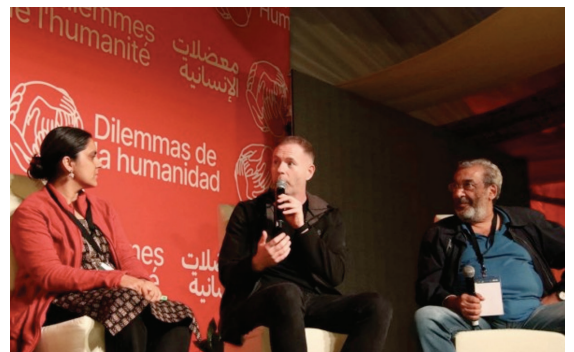
Chris Hazzard MP spoke at the international conference in Johannesburg, South Africa