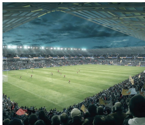
Casement Park (to be built) – Belfast

“This tournament will leave a real legacy that will benefit grassroots football on this island and inspire young footballers for years to come.”