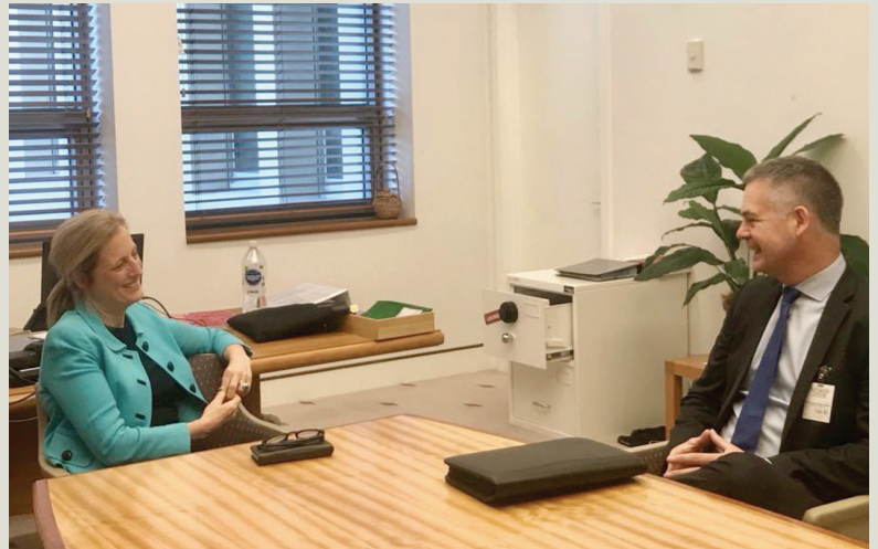
Pearse Doherty TD and Finance Minister Sen. Katy Gallagher