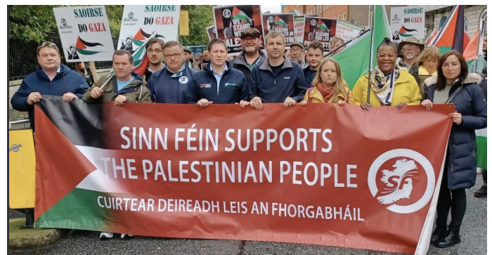
Sinn Féin activists – Dublin

“There can be no equivocation, this war must end immediately.”