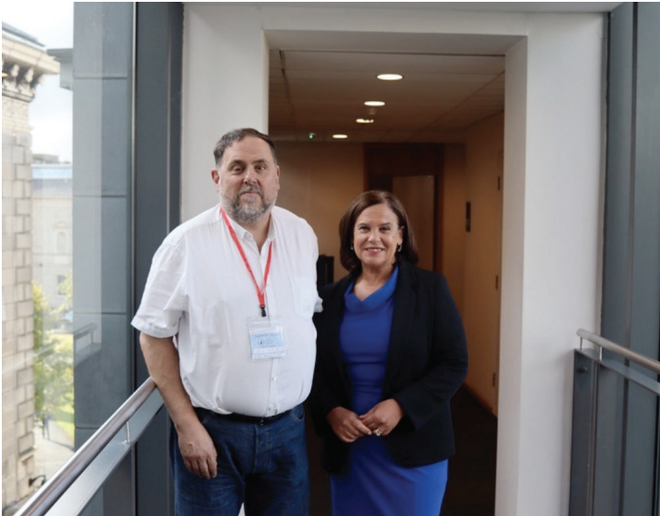
Mary Lou McDonald TD and Oriol Junqueras