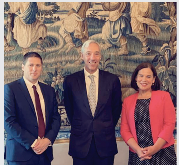
TDs Mary Lou McDonald & Matt Carthy with Portuguese Foreign Minister João Cravinho

"The notion of Ireland emerging as a European leader is fostering a belief beyond the island's shores that Sinn Féin can play a pivotal role in transforming Europe into a bastion of prosperity, peace, human rights, and social justice."