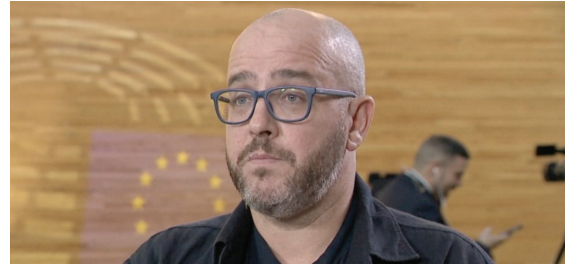
Chris MacManus MEP expressed solidarity greetings to the congress in Turkey via video.