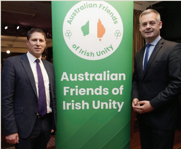
TDs Matt Carthy & Pearse Doherty – Australian Friends of Irish Unity