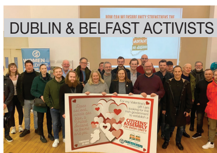
DUBLIN & BELFAST ACTIVISTS