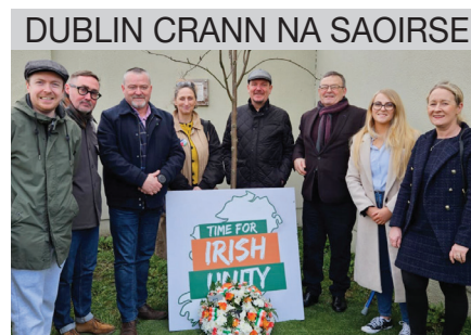
DUBLIN CRANN NA SAOIRSE