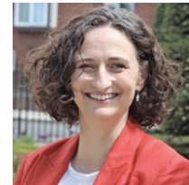
Lynn Boylan (Senator)