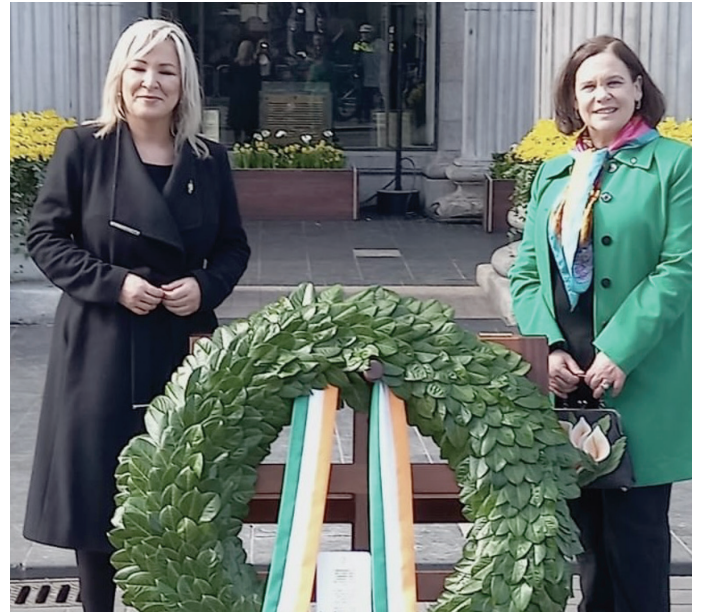
Sinn Féin President Mary Lou McDonald and First Minister Michelle O’Neill

Leyen’s damaging leadership of the EU; and oppose the drift of the EU towards militarization.”