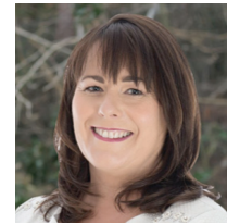
Michelle Gildernew (MP)