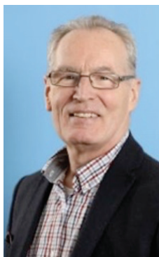
Gerry Kelly MLA

In a ground-breaking ruling by the Belfast High Court, the “immunity clause” embedded within the British government’s Legacy Act has been declared to egregiously contravene the fundamental principles enshrined in the European Convention on Human Rights (ECHR).