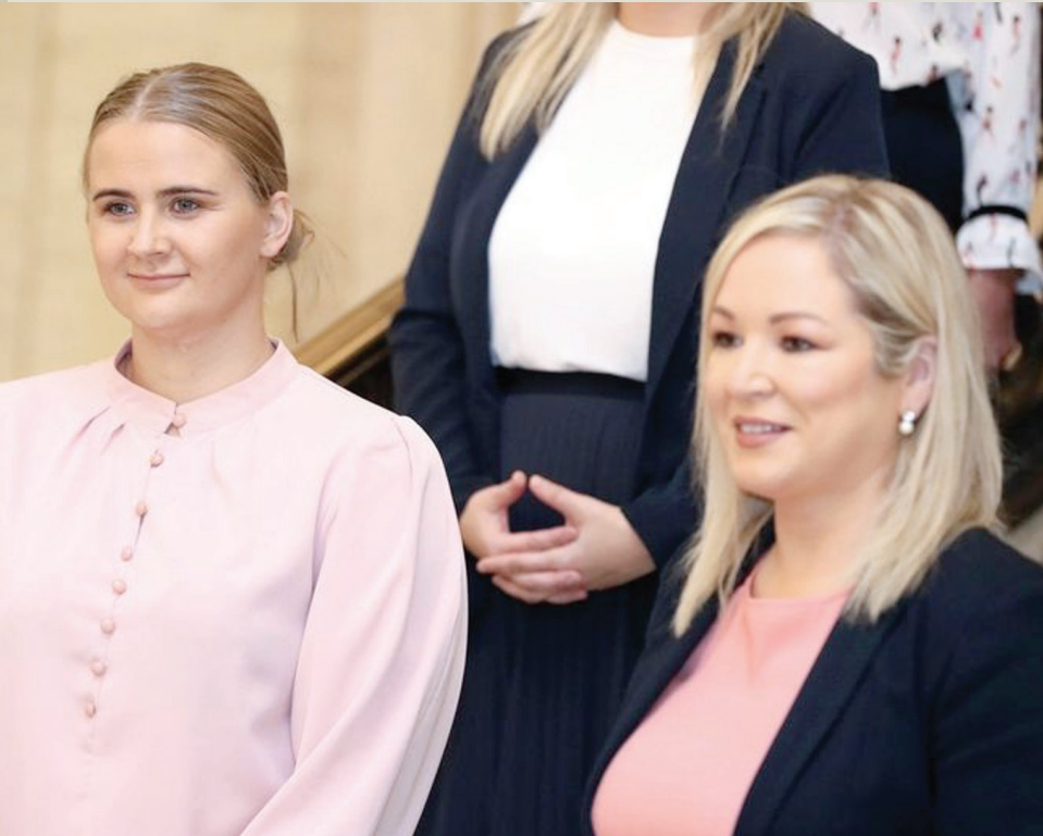
First Minister Michelle O'Neill and Jr Minister Aisling Reilly