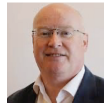
Paul Gavan (Senator)