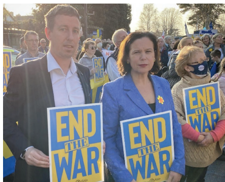
Mary Lou McDonald TD, Dublin

divisive legacy wrought by colonisation, occupation and the denial of self-determination must end.