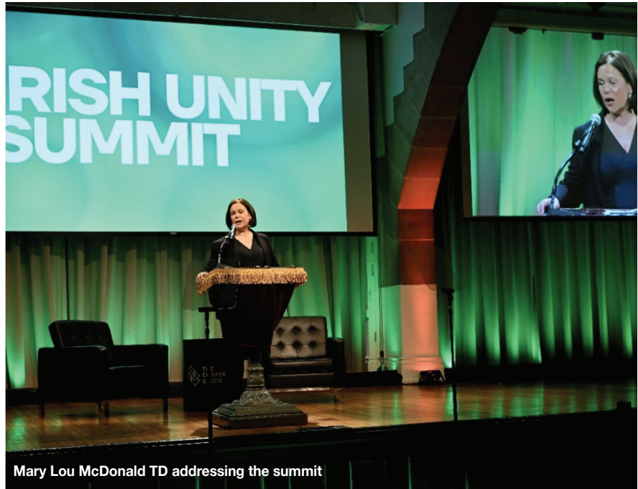
Mary Lou McDonald TD addressing the summit

“But I believe that with every conversation, every debate, every initiative, we plant the seeds of a United