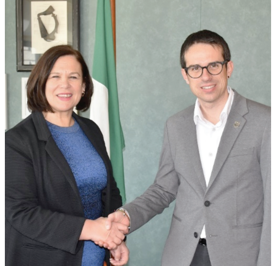
Mary Lou McDonald TD & Pello Otxandiano Kanpo