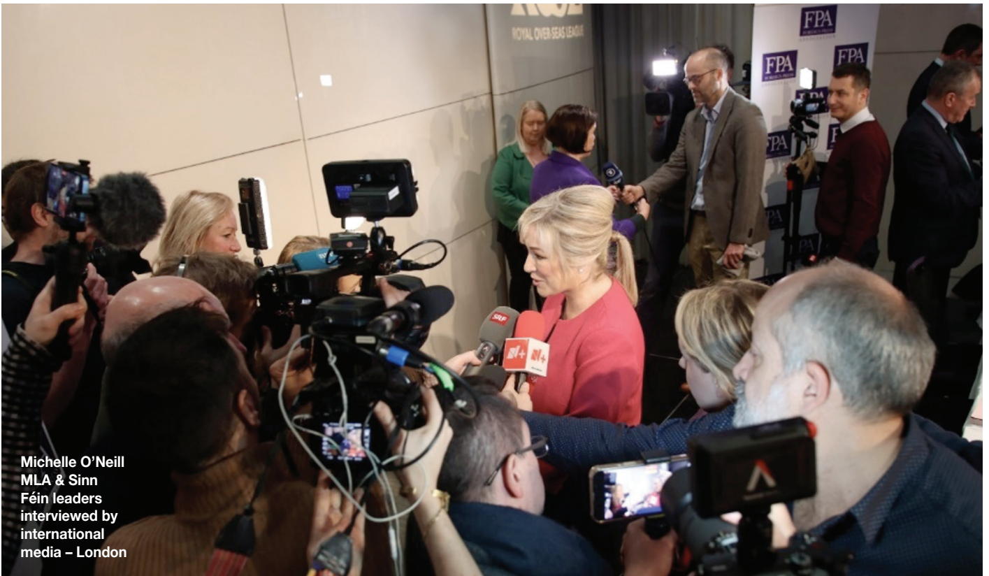
Michelle O'Neill MLA & Sinn Féin leaders interviewed by international media - London

"This legislation must be repealed and replaced with the Stormont House legacy mechanisms in a human rights compliant manner."