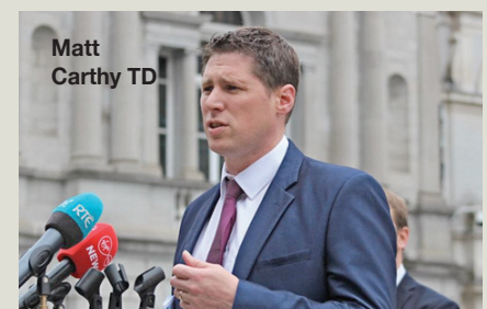
Matt Carthy TD

“This legislation must be allowed to proceed as a matter of urgency.”