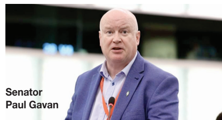
Senator Paul Gavan