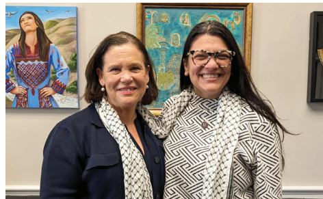
Mary Lou McDonald TD and Rep. Rashida Tlaib

constructive role to securing: an immediate ceasefire in Gaza; full humanitarian aid; an end to illegal settlements in the West Bank, and a sovereign Palestinian State."