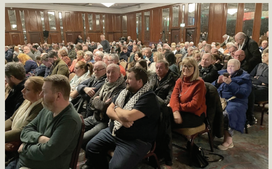
Activists attending the Sinn Féin Belfast Europa Hotel solidarity event

“This should take primacy over everything else.