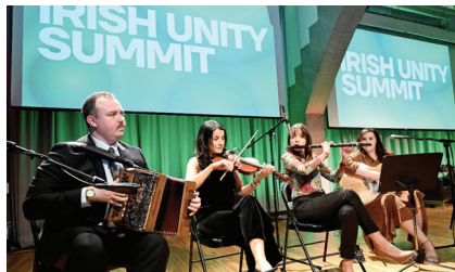
Irish Traditional musicians playing at the summit